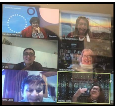
Online Teaching and Learning