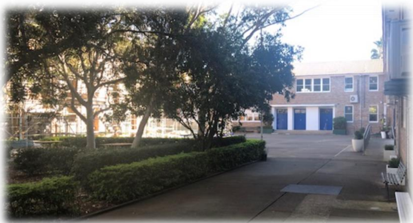
Our deserted quad and front office We're missing YOU!