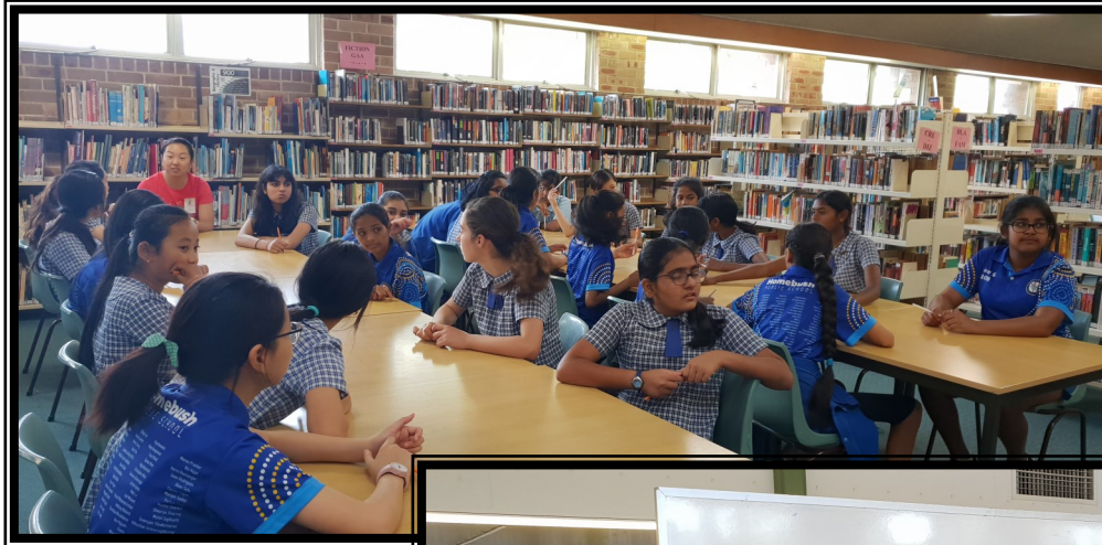
SRC Body 2018

Our final Being 10 session for the year was held on Thursday, 6th of December 2018 with Homebush Public School as part of the Year 6 transition activities. The girls were actively engaged with the activities that involved lots of group discussions and hands on activities. Empowerment, self confidence and talks of their aspirations and goals were discussed. The students enjoyed getting to know our SRC members and the types of activities we have here at Strathfield Girls High School. We hope the girls left the session feeling inspired, empowered and more confident. We hope to see many of them here next year!