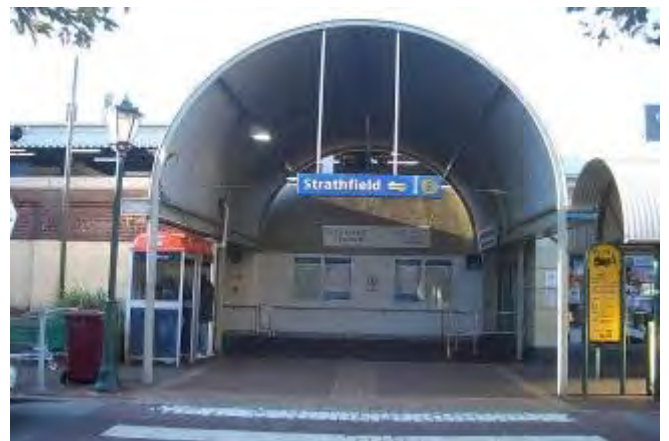
Strathfield Train Station