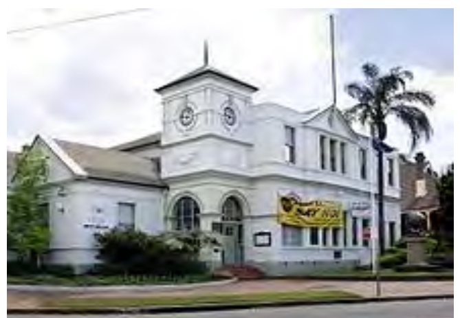
Strathfield Council Chambers

Strathfield is a suburb of the Inner West of Sydney.