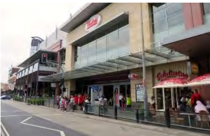
Burwood Shopping Centre